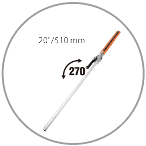
02 Hedge Trimmer