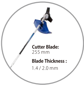
03 Brush Cutter