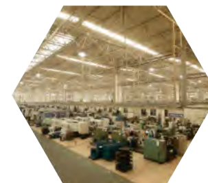
ZOMAX GEAR WORKSHOP