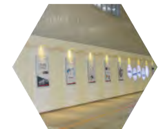
ZOMAX CULTURE CORNER