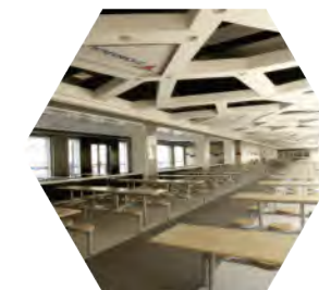
ZOMAX STAFF CANTEEN